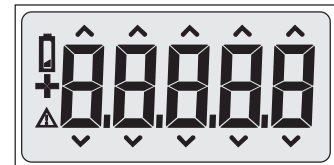
Display Segments dV-2